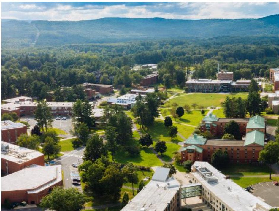
Westfield State University Campus