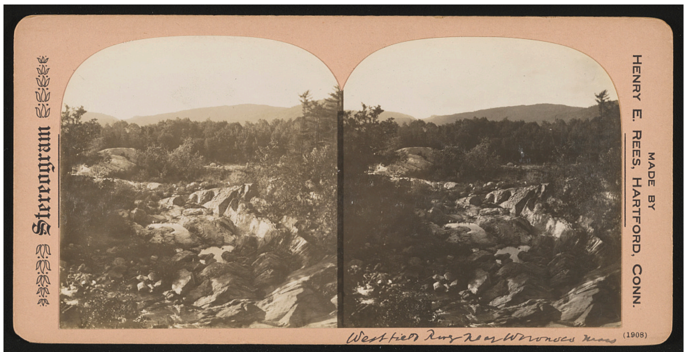
Westfield River Near Woronoco Mass, as photographed by Henry E. Rees in 1908, courtesy Library of Congress New England Historical Association - founded 1965

www.newenglandhistorians.org/newsletter/newsletter-archive/